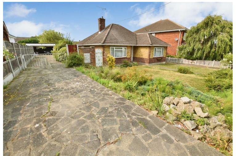
Low leveled wall frontage measuring approx. 59FT wide, hard standing driveway providing off street parking and access to double garage to rear, mostly laid to lawn with pathways leading to front entrance.